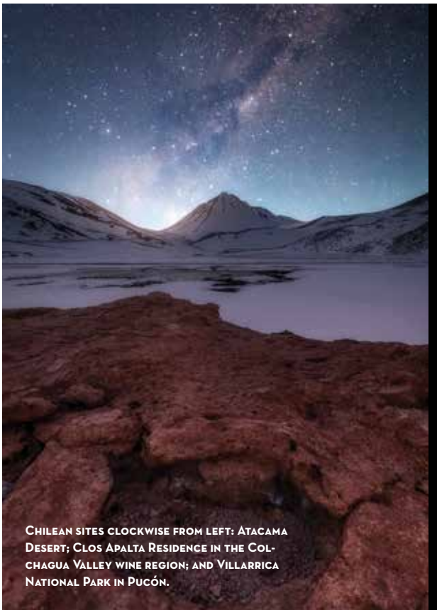
CHILEAN SITES CLOCKWISE FROM LEFT: ATACAMA DESERT; CLOS APALTA RESIDENCE IN THE COLCHAGUA VALLEY WINE REGION; AND VILLARRICA NATIONAL PARK IN PUCÓN.