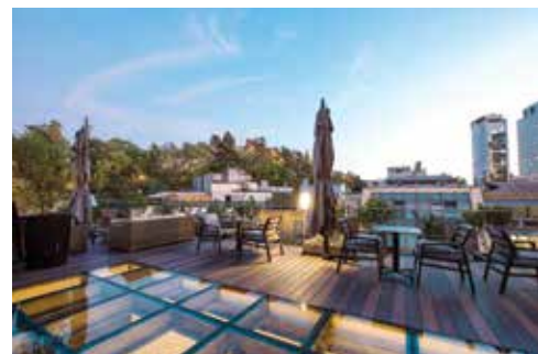
STAY AT HOTEL MAGNOLIA (ABOVE) IN SANTIAGO AND MAKE DAILY OUTINGS TO WINE COUNTRY.

Chile's most venerated valleys, Casablanca and Colchagua, typically anchor Upscape itineraries. Casablanca's cool, coastal climate fosters prime real estate for Chardonnay, Sauvignon Blanc, and Pinot Noir. And because it's located an hour from Santiago, it's easy to stay in Chile's vibrant capital by night and play in Casablanca by day. For example, overnight at Hotel Magnolia, a restored 1929 mansion in the heart of downtown,