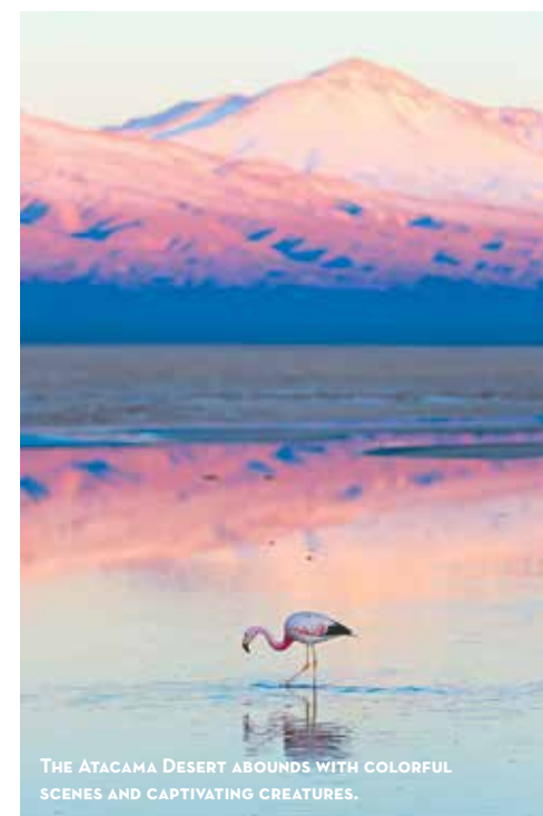
THE ATACAMA DESERT ABOUNDS WITH COLORFUL SCENES AND CAPTIVATING CREATURES.

border, where vertical sand dunes seem to defy gravity, flamingos frolic across red, green, and blue salt-rimmed lakes, and sandstone arches scrape the sky.