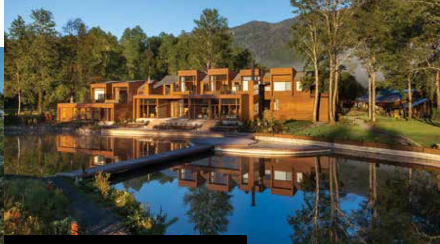
THE HACIENDA HOTEL VIRA VIRA OFFERS SUPERB ACCOMMODATIONS AND CULINARY DELIGHTS, ALL NESTLED WITHIN PUCÓN, A PRIME DESTINATION FOR OUTDOOR ADVENTURES.